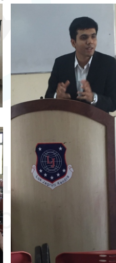
Let's Talk- speakers