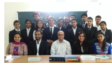
Intra Moot Court Competition