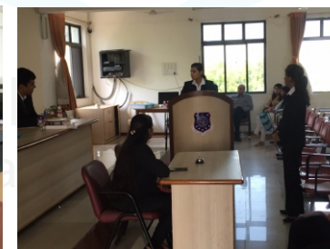
Let's Talk- speakers forum