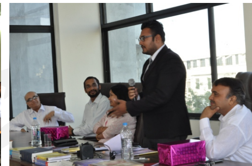
Expert Lecture by legal luminaries