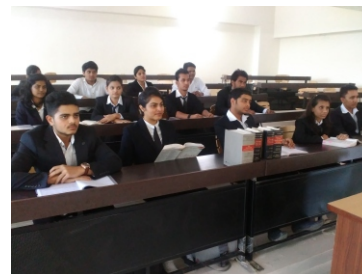
Review the view